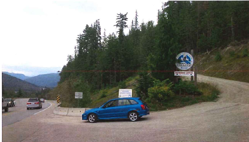
West Entrance Trans Canada Highway No.1