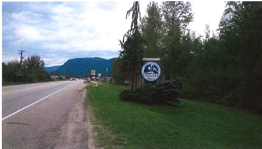
East Entrance Trans Canada Highway No.1