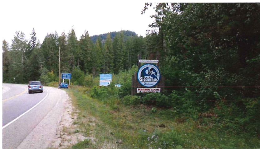
South Entrance Highway 97A