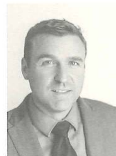
Greg Kyllo, M.L.A. Shuswap

Province of British Columbia Legislative Assembly