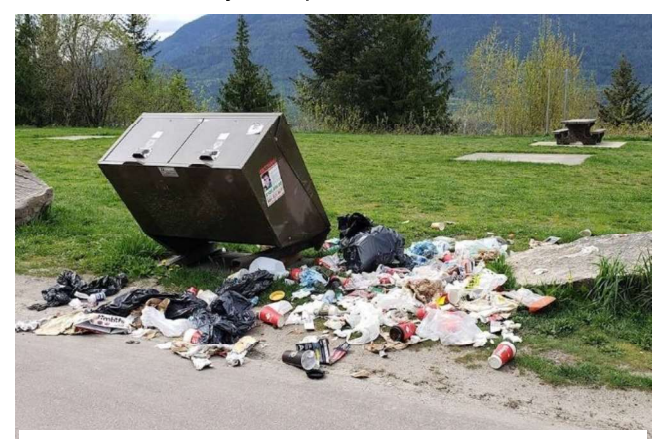
Figure 5: Dumping observed around garbage bins, taken from the Salmon Arm Observer

Residents are encouraged to report illegal dumping by contacting the Report a Poacher and Polluter (RAPP) hotline by phone or using an online form that is linked on the website. The CSRD also developed bylaw No. 5615 strictly for illegal dumping.<sup>29</sup> Illegal dumping is a ticketable offense and anyone that contravenes with the bylaw can be ticketed by a CSRD bylaw Enforcement Officer, as defined in bylaw No. 5296.<sup>30</sup> BC Conservation Services can issue fines as