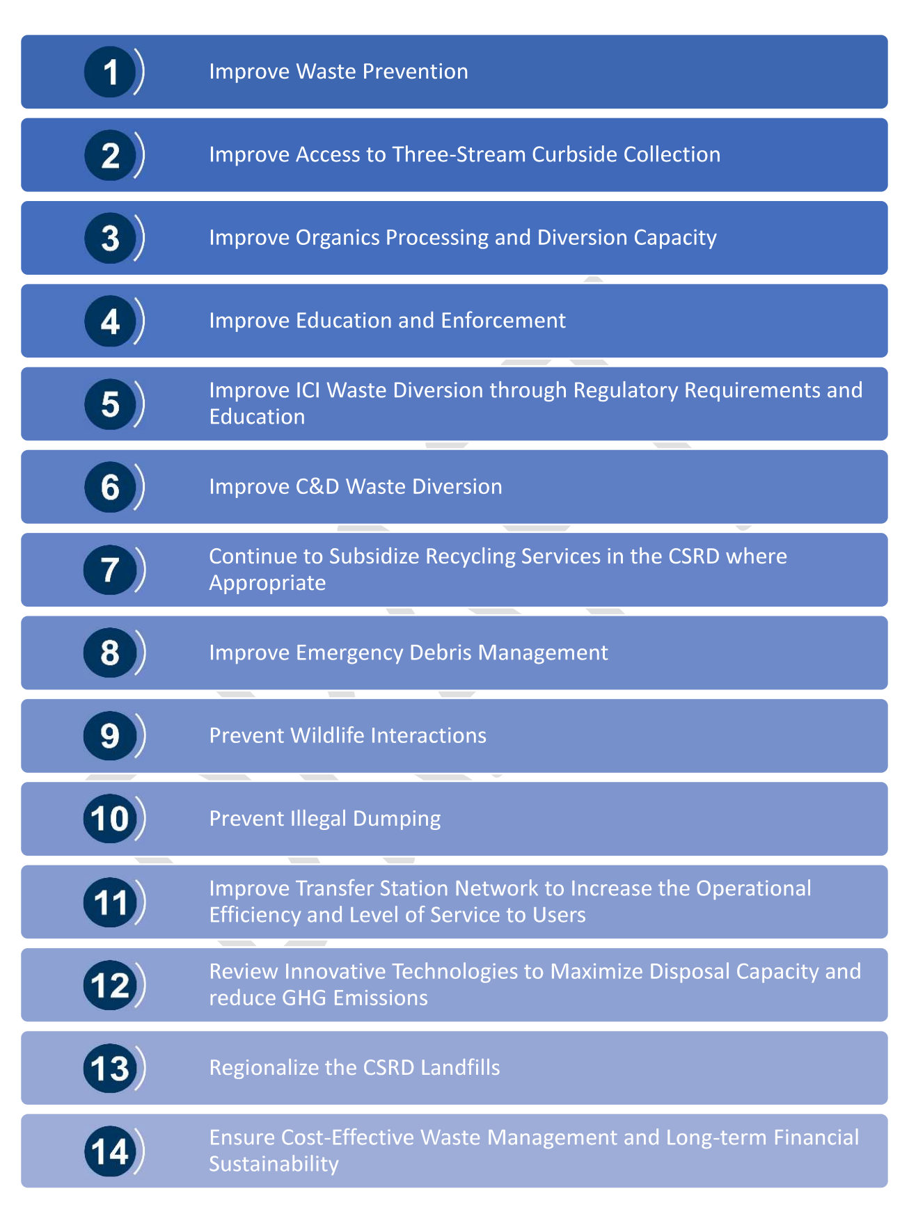
Figure 2: Overview of the fourteen new strategies for the updated SWMP