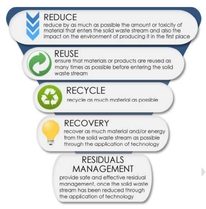
Figure 1: Pollution Prevention Hierarchy, as presented in the MOE's Guide to Solid Waste Planning (2016)