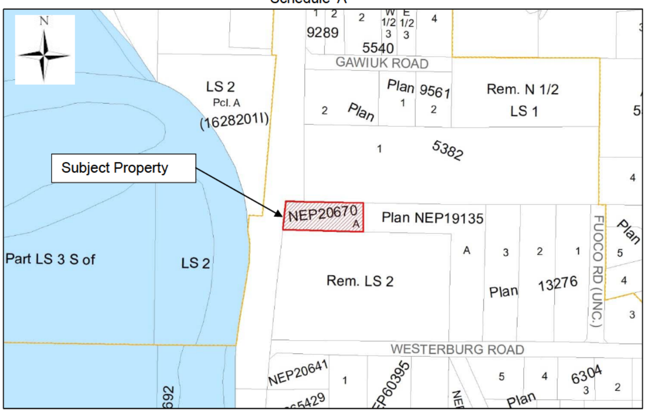
TUP 850-11 Schedule 'A'