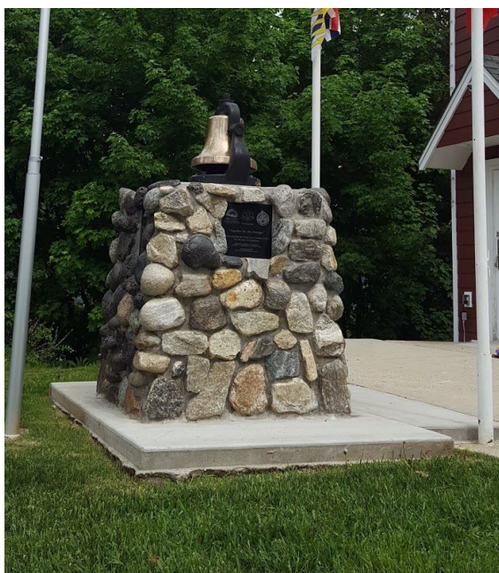
Monument @ Chase Museum