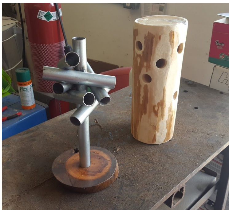
Table top examples of Secwepemc Landmarks displaying the functionality on the concept. Left, an example of what is used in Switzerland, Right, an example of a stylized version which enhances available space for pictograms and storytelling.