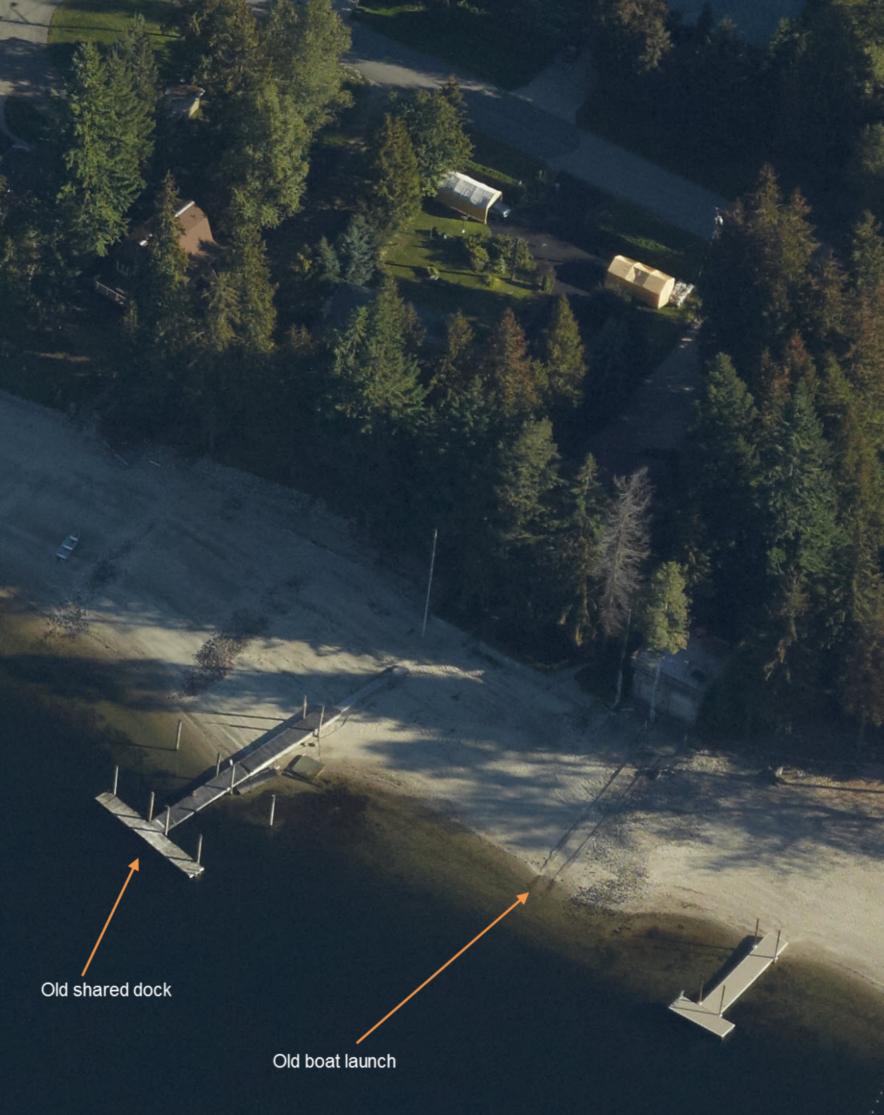
Old shared dock